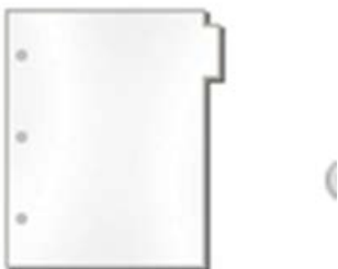
3 Hole Punched

Any other type of divider pages (commercially available, homemade or DIY) are not allowed: (see example below).